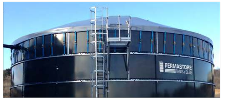
PVC Cover – Spain