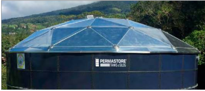
Geodesic Dome Roof – Costa Rica