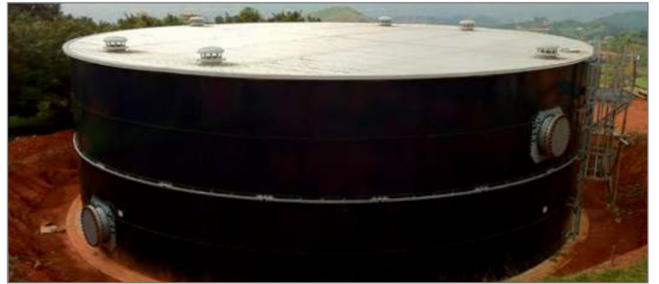
Trough Deck Roof – Drinking Water