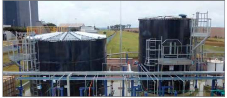
Tapered Beam Roof – Brazil