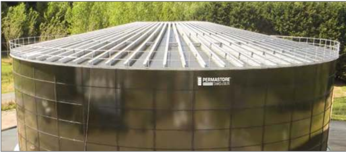
External Beam Roof – Anaerobic Digestion & Biogas