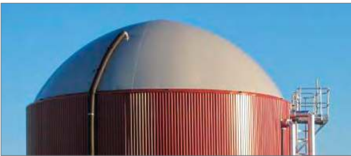
Double Membrane Dome Roof – Sweden